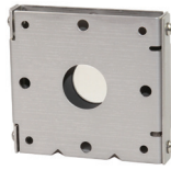
Goose Neck Mounting Bracket