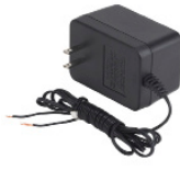
PN RPS-EXPO AC Power Adapter