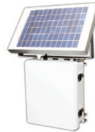
Solar Power Kit